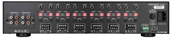
12-50 SKU 93092