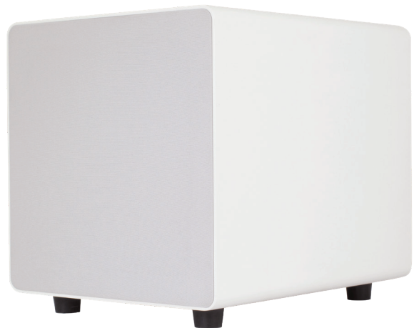
D8 WHT with Grille