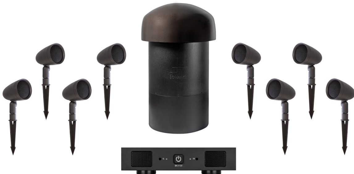
SGS System SKU 93433

8 SGS SATELLITES | 8 GROUND STAKES | 1 SGS SUBWOOFER | 1 2-125 AMPLIFIER