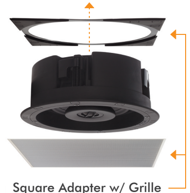
Square Adapter w/ Grille